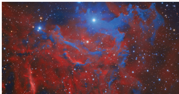
IC 405 Dancing Blue by Tony Hallas with EdgeHD 1100