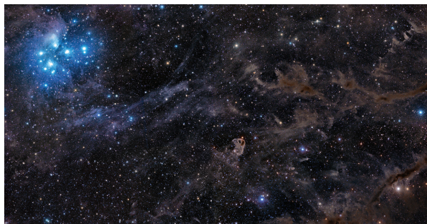
Pleiades-Mosaic by John Davis with EdgeHD 1400

Astroimaging is one of the most rewarding activities amateur astronomers can participate in. EdgeHD optics can produce results that were only attainable by professional level (and professionally priced!) equipment as little as a decade ago. Hundreds of thousands of amateur astronomers now spend their time under the night sky, capturing stunning images of the heavens above.