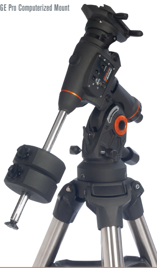
CGE Pro Computerized Mount