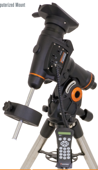
CGEM Computerized Mount