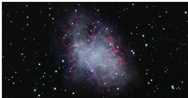
Crab Nebula by Andre Paquette with EdgeHD 1400