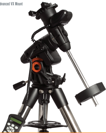
Advanced VX Mount